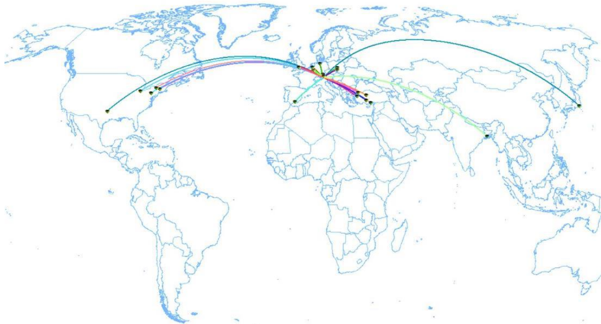
Figure 2: Participants of IGU CDES Mini-Conference on Rural-Urban Linkages for Sustainable Development: An Economic Geography Perspective held in Innsbruck, Austria, 2018

The conference was held under seven session on the following themes: