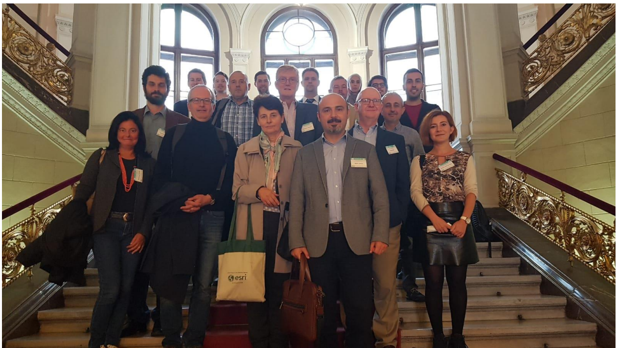
Photo 1: Some of the participants of the IGU CDES conference in Budapest, Hungary, 2-4 October 2019.